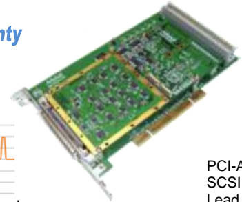
PCI-A429 SCSII to Flying Lead Cable Provided

Alta Data Technologies' PCI-A429 interface modules offer a variety of ARINC-419/429/575/573/717 channel configurations with software selectable Rx/Tx channels, baud rates, bit encoding and word configurations (Start/Sync/Stop length, Parity, bits/word, MSB/LSB). Encode or decode almost any ARINC-429 physical layer signal.